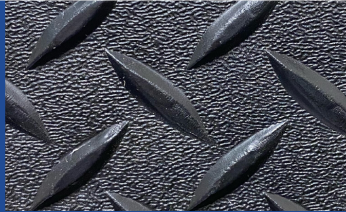
Our diamond pattern surface enhances traction on 1 side

Our Cope Ground Protection Mats are created using a durable custom blend of virgin PE resins for a better, longer-lasting alternative to plywood mats.